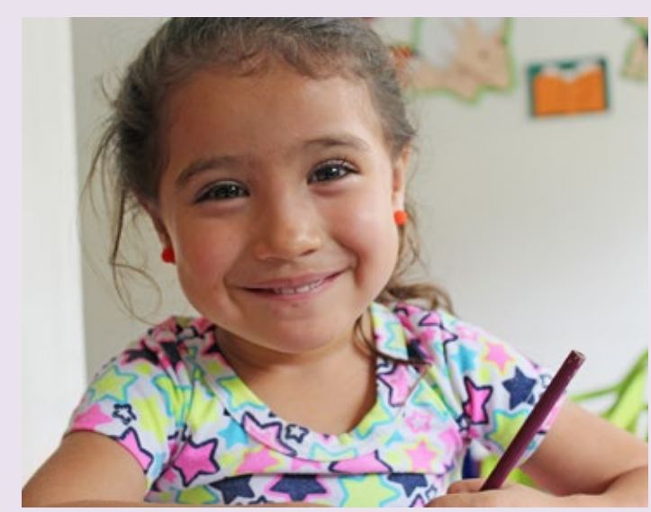
This picture comes from the worldwide programme work of SOS Children's Villages and serves to illustrate the day care centre in Spain.